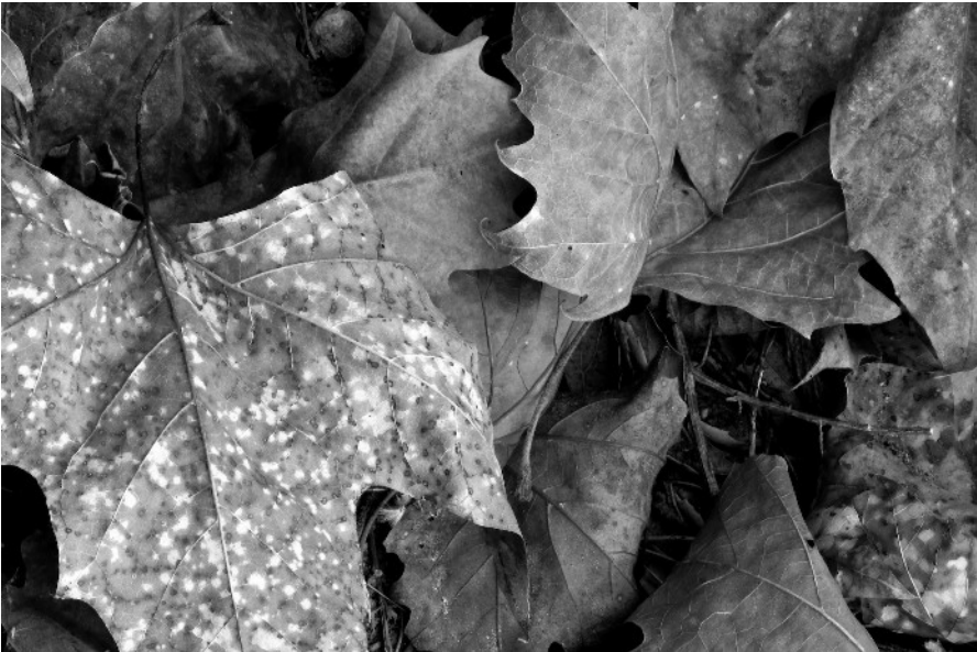
Photograph Kathleen Gunton / Orange, California