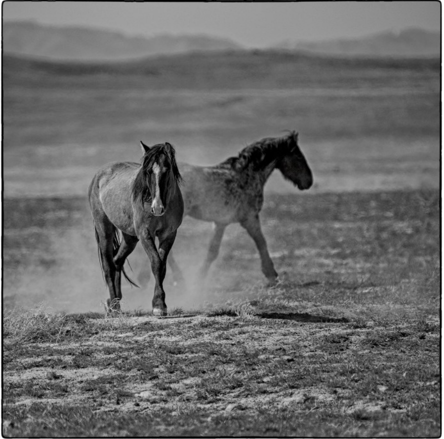
Havertown, Pennsylvania