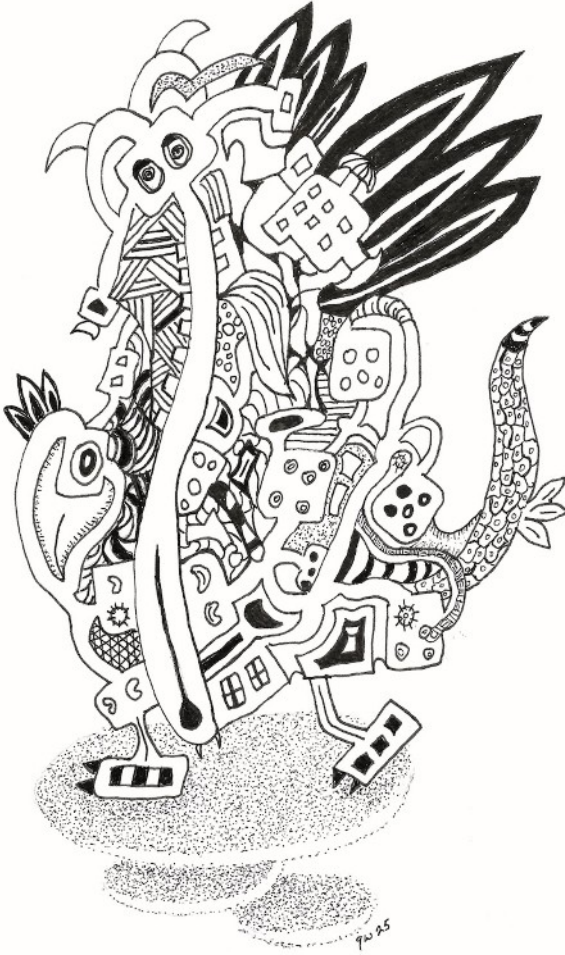
Drawing Gary Wadley / Louisville, Kentucky